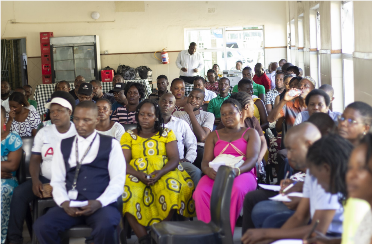
Figure 2: DWASCO SACCO AGM Delegates