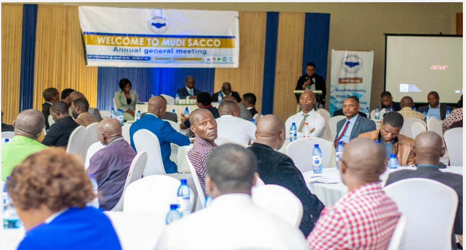
Figure 1: MUDI SACCO AGM

Notably, Plan Malawi SACCO has now reached MK1 billion in total assets! Congratulations.