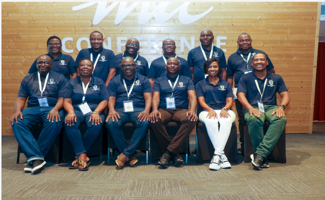
Figure 5: Malawi Delegation at 2024 CEO & Chairpersons Forum