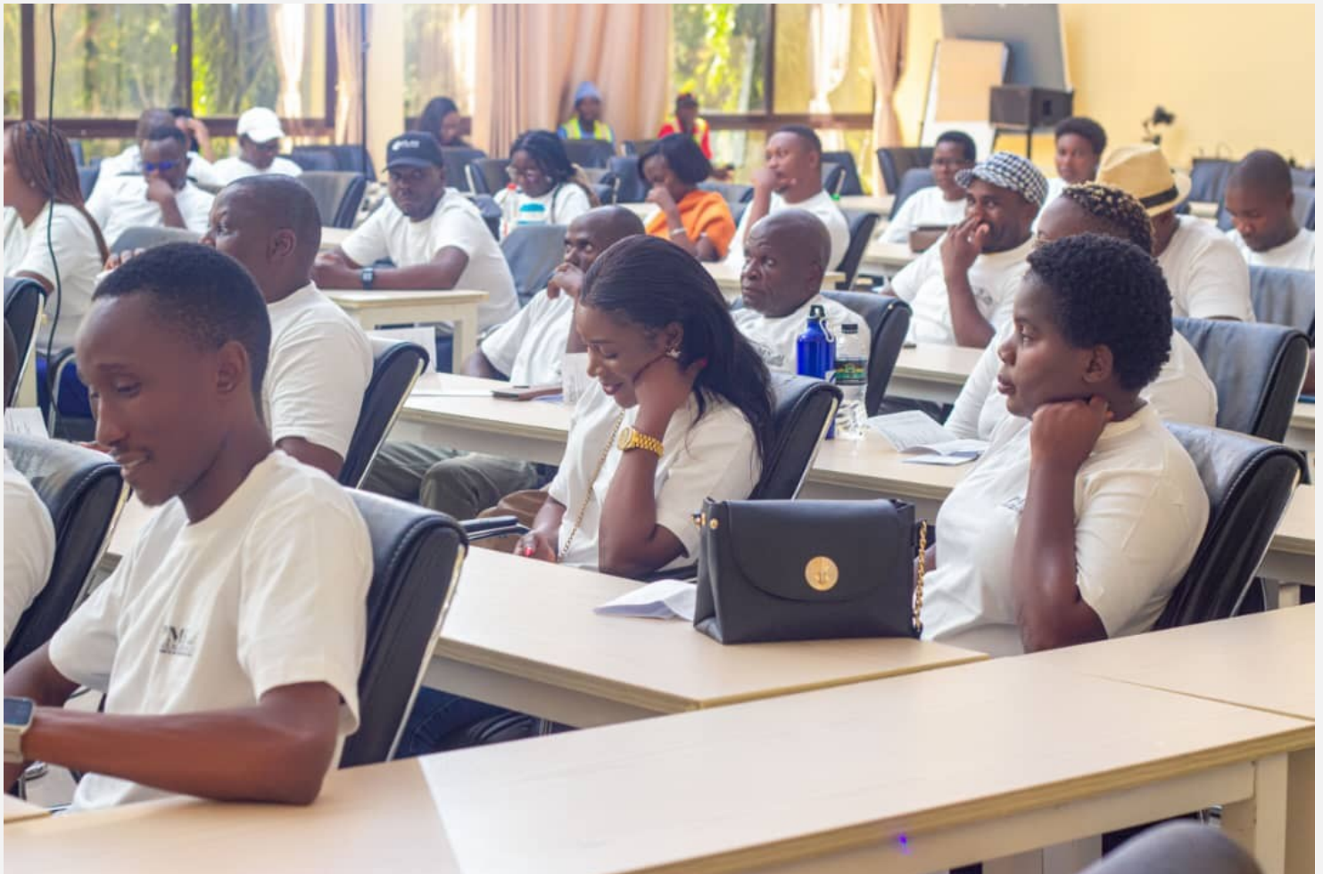
Figure 3: Plan Malawi SACCO delegates